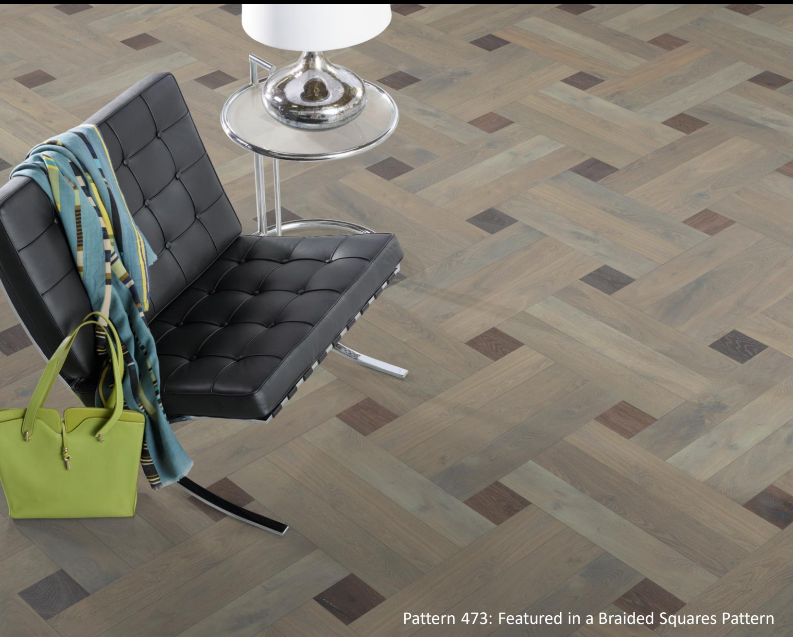
Pattern 473: Featured in a Braided Squares Pattern

Wood parquet floors are a timeless option that brings warmth and character to any space in your home. Stunning parquet wood tile designs range from simple to complex geometric patterns. Wooden floor tiles offer a level of visual appeal that cannot be achieved with traditional strip flooring boards. Although parquetry has a rich history dating back to the 17th century, it remains popular today and can be found in many modern homes and businesses throughout the world.