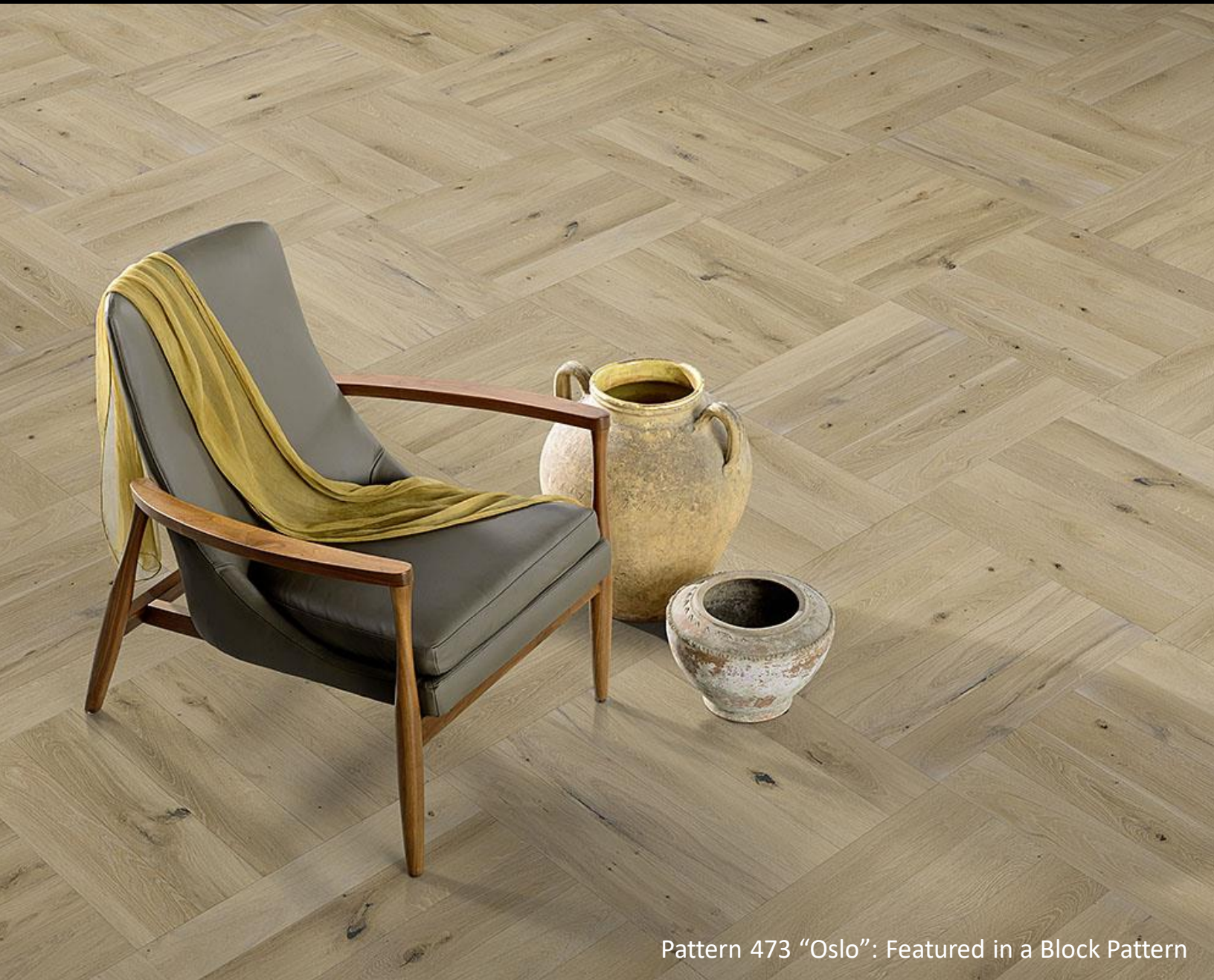
Pattern 473 "Oslo": Featured in a Block Pattern

Wood parquet floors are a timeless option that brings warmth and character to any space in your home. Stunning parquet wood tile designs range from simple to complex geometric patterns. Wooden floor tiles offer a level of visual appeal that cannot be achieved with traditional strip flooring boards. Although parquetry has a rich history dating back to the 17th century, it remains popular today and can be found in many modern homes and businesses throughout the world.